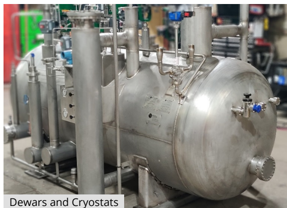
Dewars and Cryostats