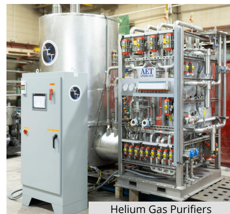
Helium Gas Purifiers