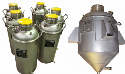
Jacketed Containment Vessels