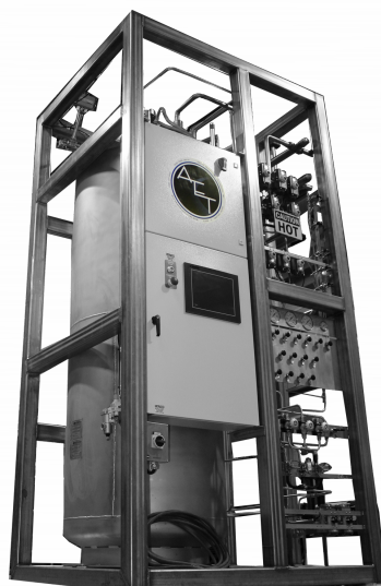
Gas Purification Systems (Hydrogen with Remote Controls)