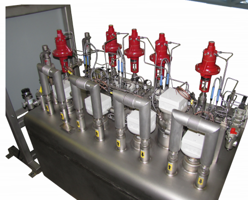
Cryogenic Distribution Systems and Valves

FOR MORE, PLEASE VISIT WWW.ABILITYENGINEERING.COM/HYDROGEN/