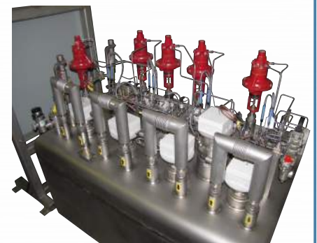
Expansion Cans & Dewar/Valve Boxes

FOR MORE, PLEASE VISIT WWW.ABILITYENGINEERING.COM/LAB/