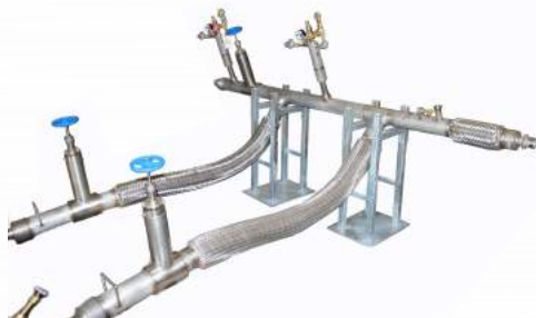
Vacuum Insulated Piping