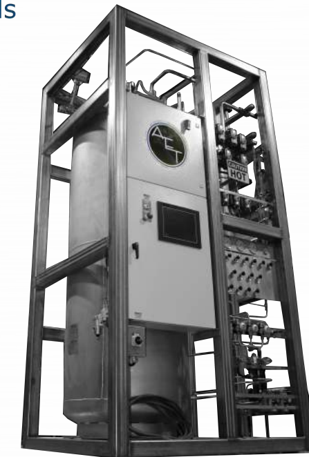
Cryogenic Gas Purifiers Helium, Hydrogen & Others