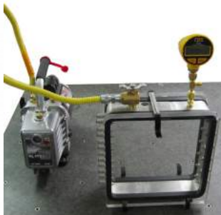
Custom Research Equipment (High Visibility Vacuum Chamber)